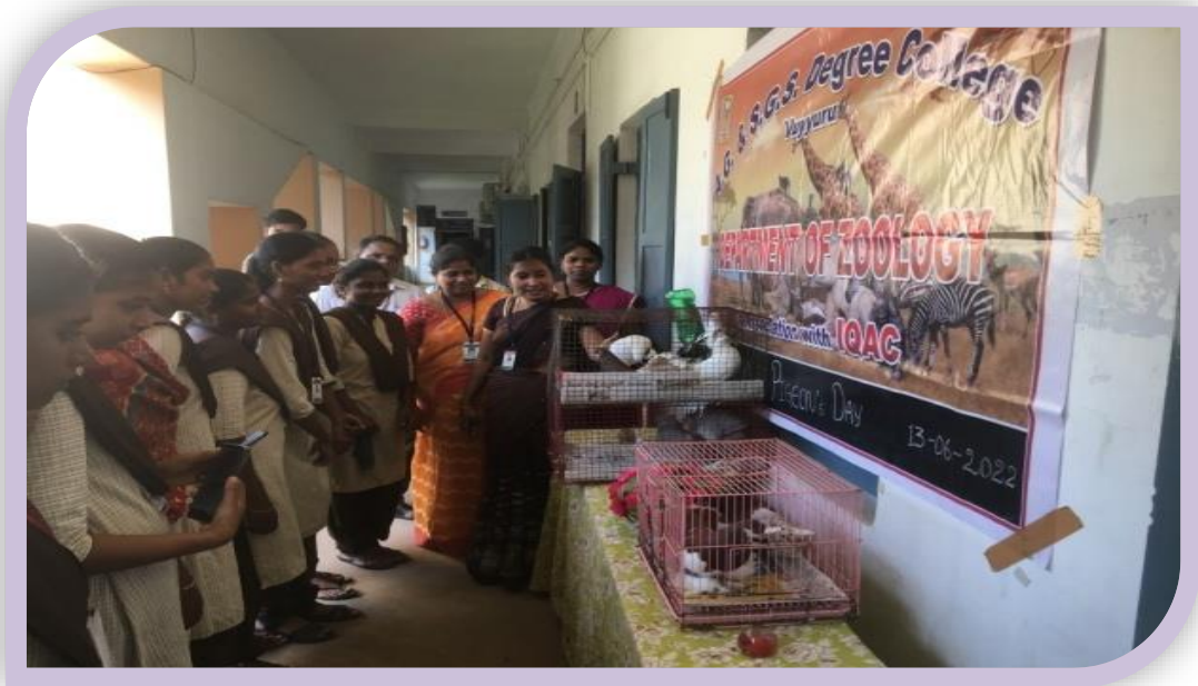
Zoology Staff explaining the varieties of pigeons to students