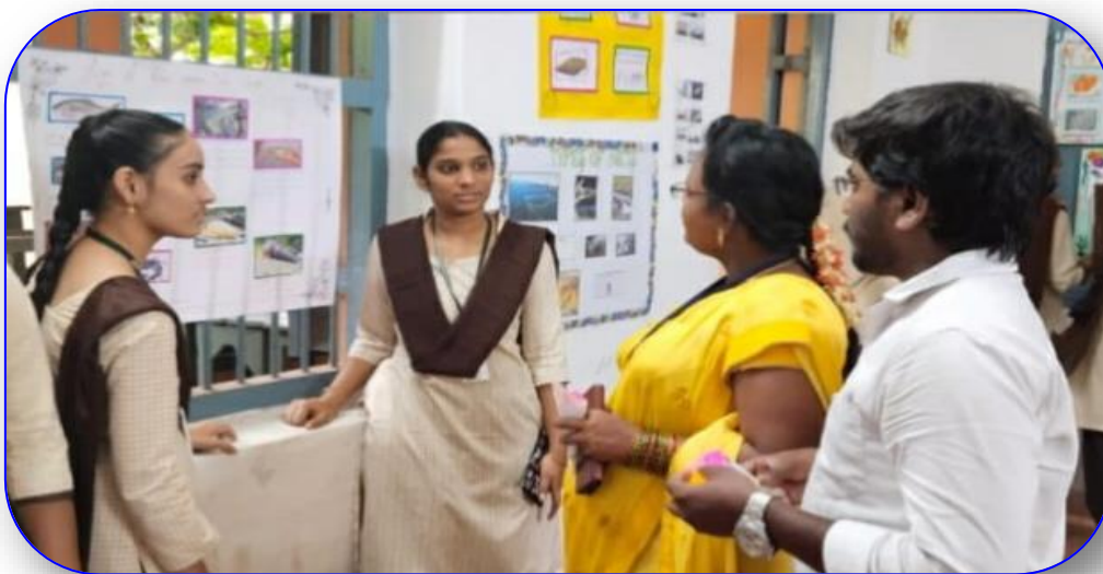
Students explaining to staff