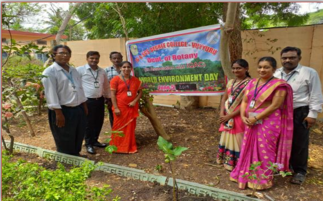
Zoology, Botany and Environmental studies staff at plantation program