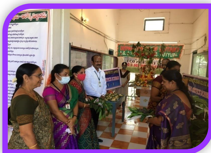
Celebrations of Eco-friendly VinayakaChavathi festival in our college

The event was ended by vote of thanks by the students.