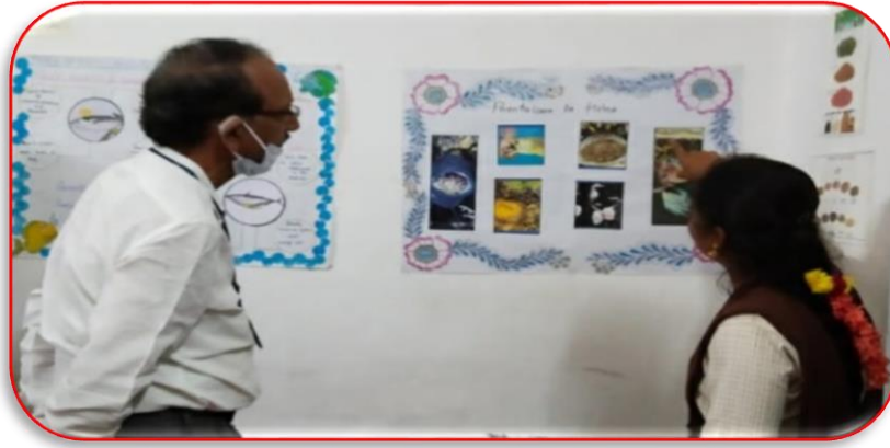
II BZC student explaining preservation of fishes to Principal