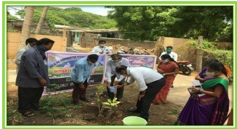
On the Occasion of World Environment Day College Principal planted Saplings in the campus