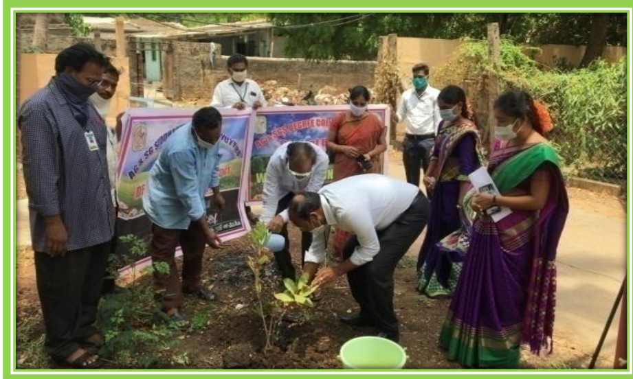
On the Occasion of World Environment Day College Principal planted Saplings in the campus