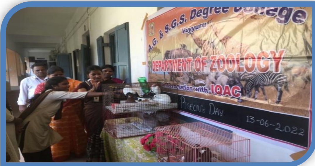
Student asking a Query