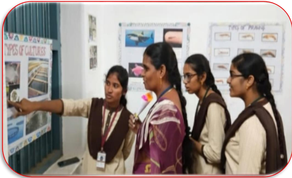
Abigeyulu, II BSc. Aqua student explaining types of culture to staff and students